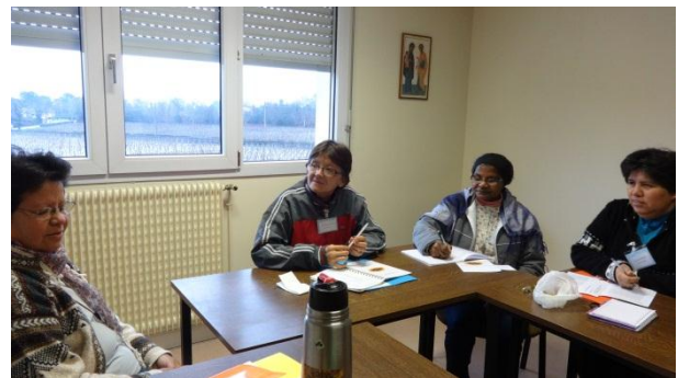
Network Latin America