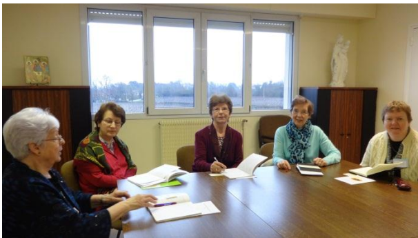
Britain & Ireland

In the afternoon , the participants worked in their own teams looking at the global/particular context and the opportunities and challenges they face.