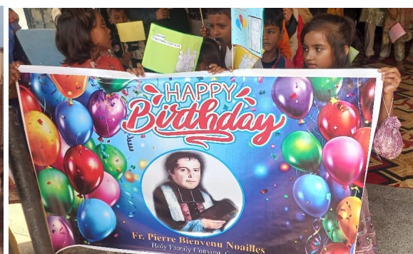
Holy Family Sisters Pakistan